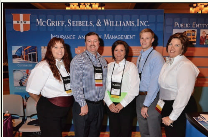
McGriff, Seibels, & Williams, Inc.