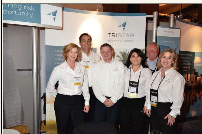
TRISTAR Insurance Group