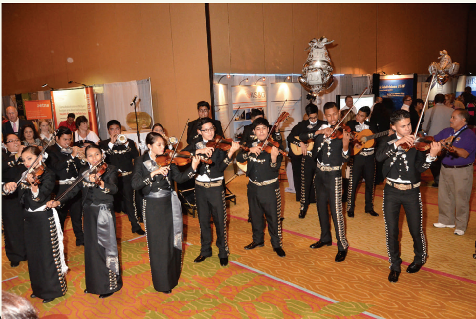
Mariachi Band provides entertainment for the grand opening of the exhibit hall.